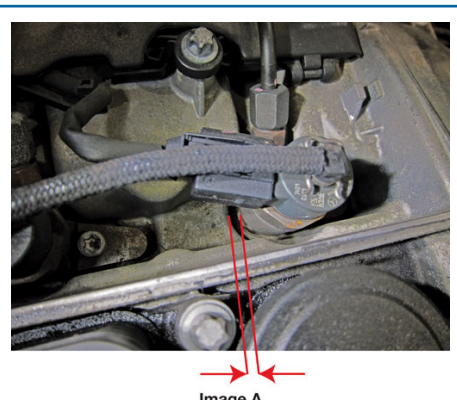
Image A This tool cannot be used on engines with this cam cover design (2.7 CDi/CRD)